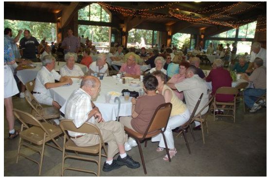
Just a few of the Knights & families attending