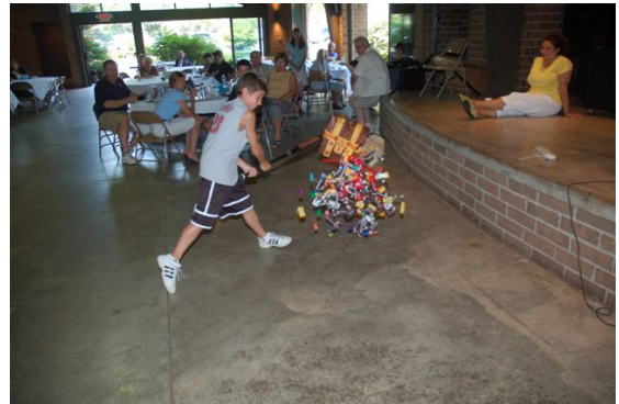
The finish of the Piñata