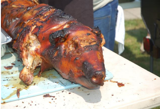
The Guest of honor