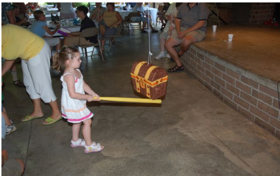
The start of the Piñata