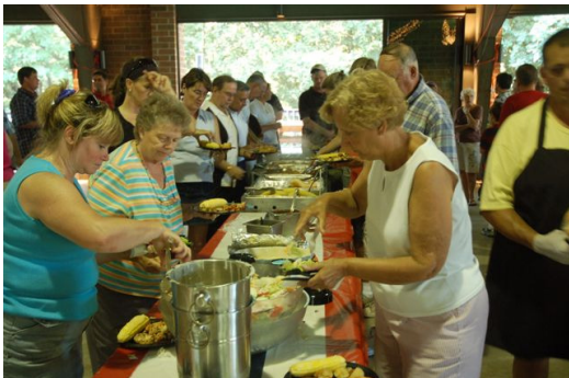
Plenty of food & friendship