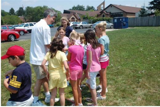
The start of the children games