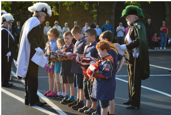
Knights of Columbus Council Flag Retirement Ceremony At St Clarence, The Cub Scouts and the Fourth Degree helped.