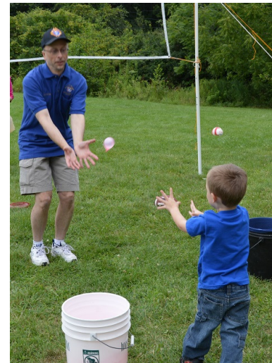
North Olmsted Council 4731 Annual Picnic, held at St. Clarence.