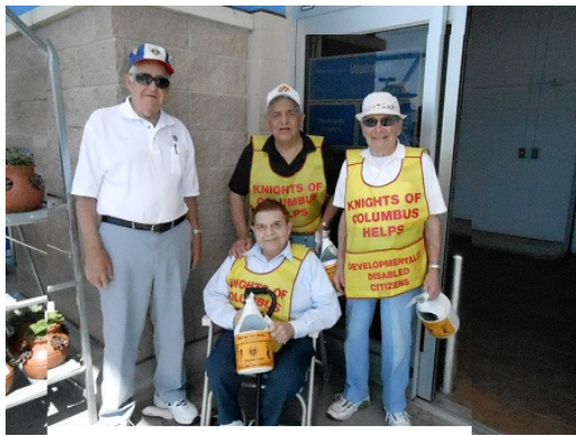
Measure Up Campaign collection at North Olmsted Wal-Mart Store. The weather can change from day to day.