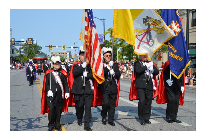
Kams Conner Annual Independence Day Parade. Several Knight march in this parade to show our love for Our Country.