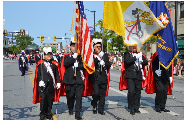
Kams Conner Annual Independence Day Parade. Several Knight march in this parade to show our love for Our Country.