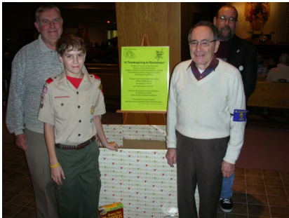
The Boy Scouts help the Knights with a food collection at St Brendan's