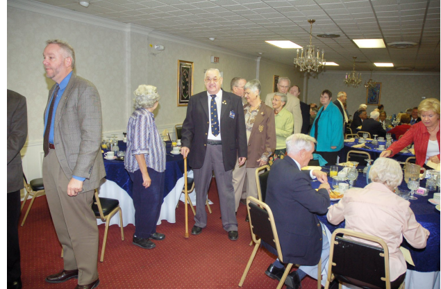
Communion Breakfast at the North Olmsted Party Center