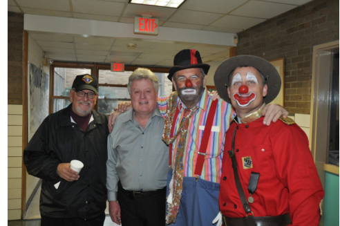
North Olmsted Council 4731 40th Annual Christmas Party for the children at St. Augustine's. Additional Photo's on Page 6