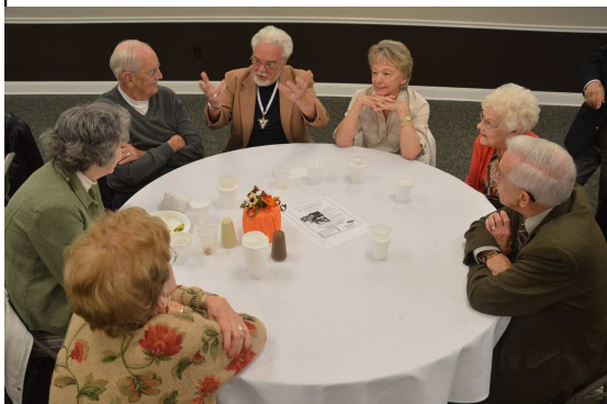
Communion Breakfast in this past Fall