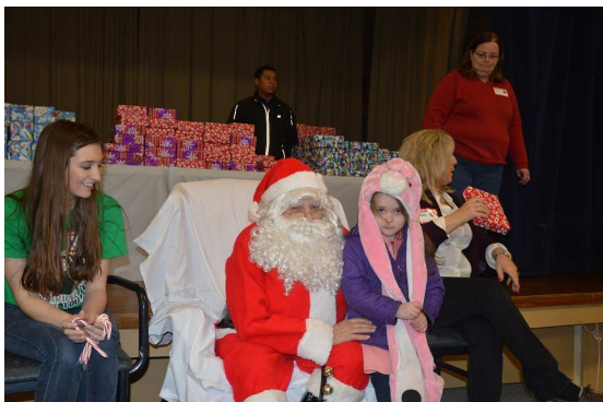
Additional photo of St. Augustine Children Christmas Party Sew page 6 for more.