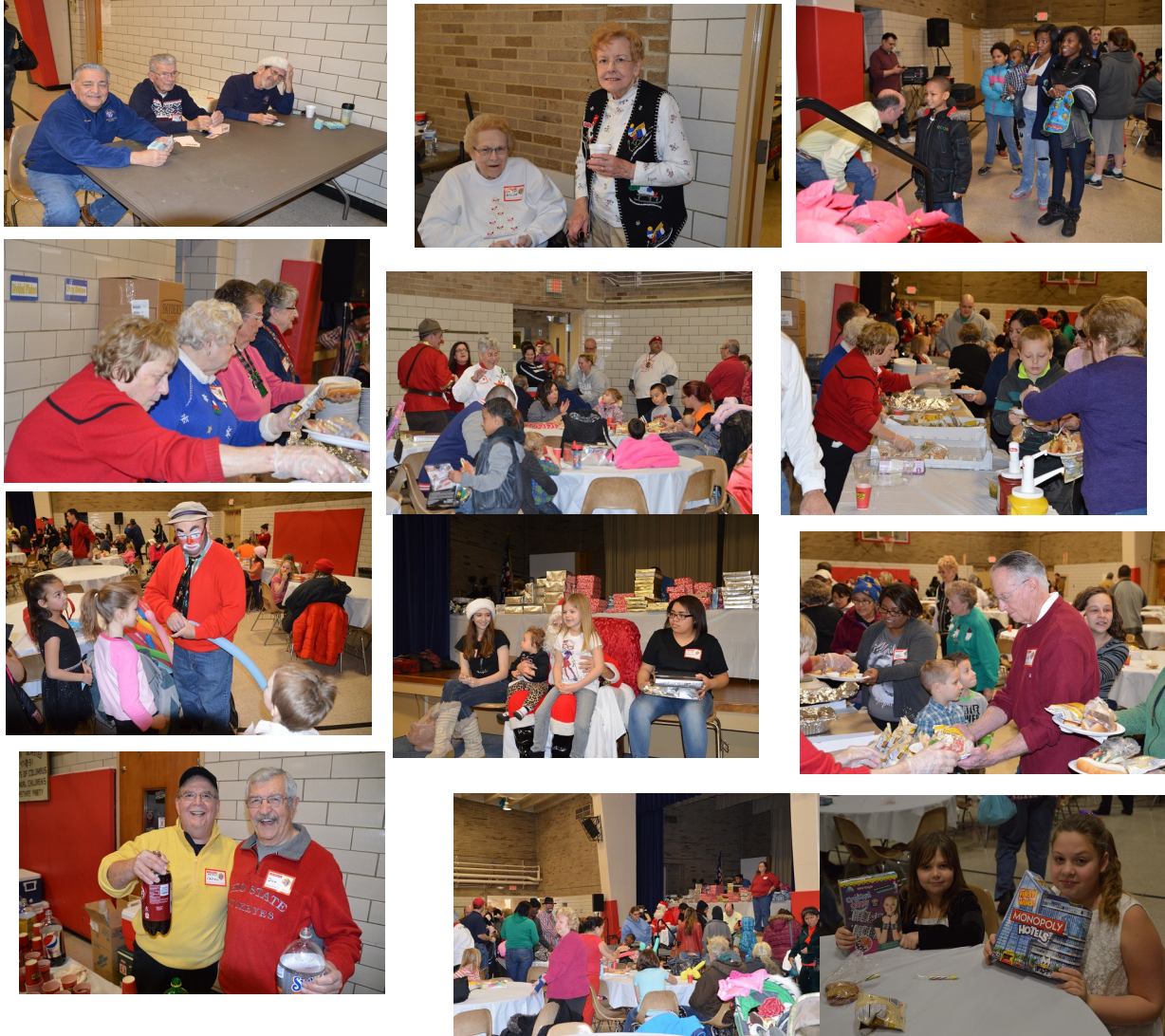
St. Augustine Children Christmas Party, Santa with his helpers