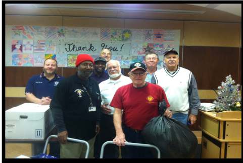
Knights of Columbus at the Cleveland VA