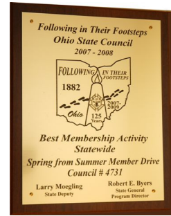
Best Membership Activity Statewide