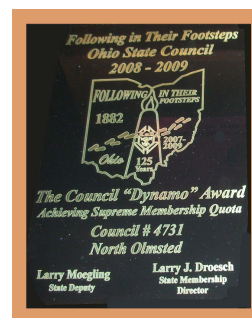
DYNAMO Award Membership