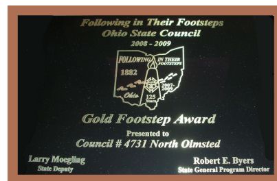
Gold Footstep Award