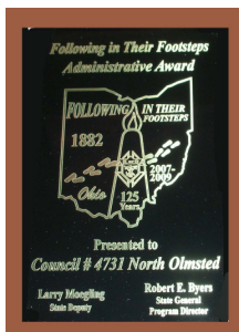
Footstep Administrative Award