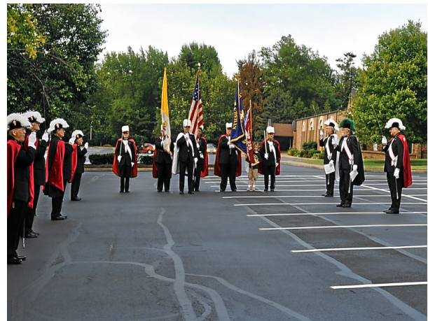
Just a few of the pictures that were taken at the Flag Ceremony. There were about fifty people attending this years event.