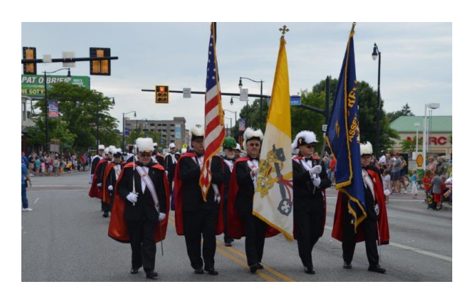
4<sup>th</sup> Degree Sir Knights, many of them North Olmsted Council members, lead the Knights of Columbus contingent in the West Park 4<sup>th</sup> of July parade.