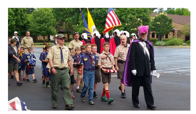
North Olmsted Council was assisted by the Bishop O'Reilly Assembly of 4<sup>th</sup> Degree Sir Knights, the North Olmsted VFW post, the Boy Scouts and Cub Scouts for the flag retirement ceremony.