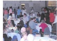
04 249 attendees.JPG