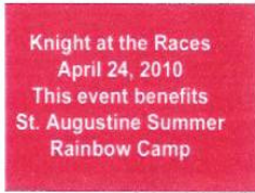
00 Knight at the Races.jpg