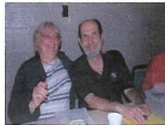
07 We're having fun.JPG