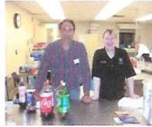
01 Drinks on Us.JPG