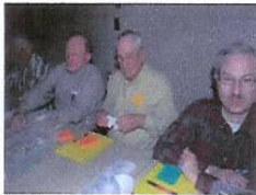
06 over 30 Volunteers.JPG