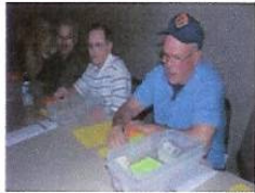
05 Place Bets here!.JPG