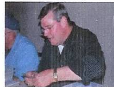
08 Count your changel.jpg