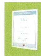
38 Shining Armor Certificate.jpg