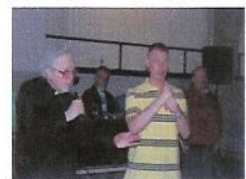
14 Thank you for attending.JPG

Measure Up Campaign April 22 – May 2, 2010 Helps Developmentally Disabled Citizens Thank you Wal-Mart for allowing us to have this campaign on your premise.