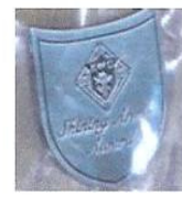
39 Shining Armor Pin Award.jpg