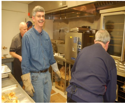
Brother Knight cooking at the Fish Fry at St. Clarence Church. This happens on Ash Wednesday and each Friday during lent.