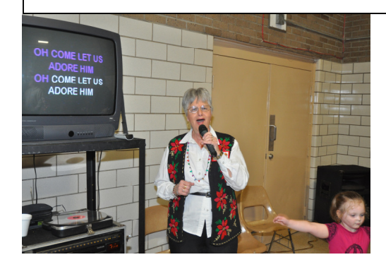
St Augustine's Christmas Party

Each Knight receives the emblem as a lapel pin upon initiation.