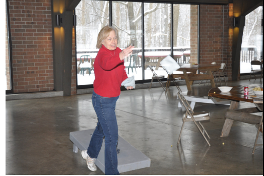
Corn Hole family contest held at St Clarence Pavilion. The event was enjoyed by all who attended