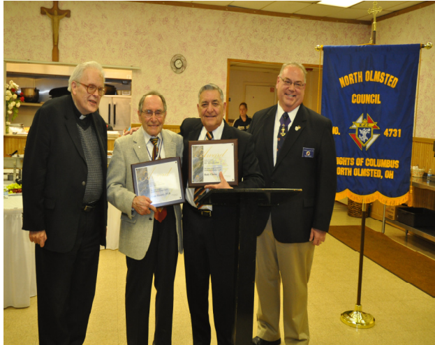
Fr. Joseph D. McNulty Award for Exceptional Dedication – 2013 (New award this year)