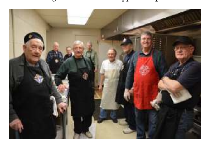
Got fish? These men can use your help – especially you younger members, as you can see. Please read the article above and consider volunteering to help out for a few weeks during Lent at the St. Clarence fish fries.

Volunteers are needed to man the kitchen and for other duties. Come early to set up, late to clean up, or during the event to help cook and serve. If you are not able to help out, please consider patronizing one of the weekly fish fries for a good meal and to support the parish.