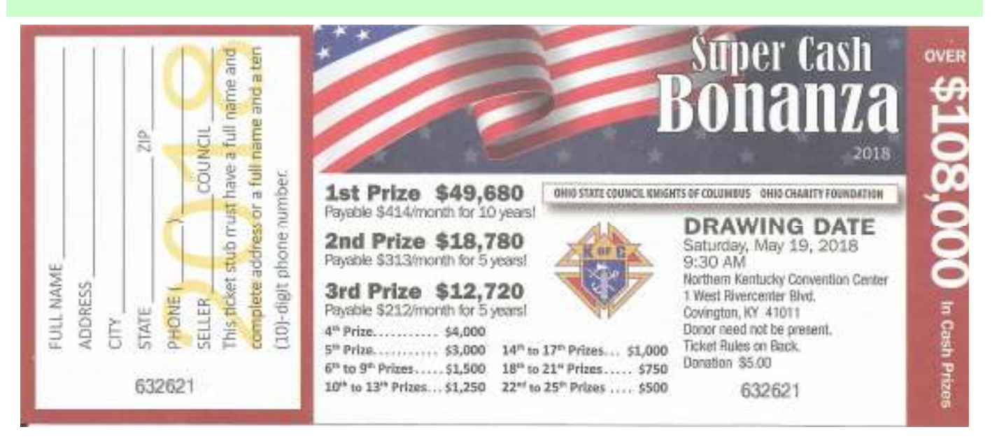
Have Fun . . . Man Our "Super Cash Bonanza" Public Ticket Sale Locations

"Super Cash Bonanza" is a huge fundraiser for our council. So North Olmsted Council needs you to man a shift to sell tickets at the following locations: Avon Lake Giant Eagle April 13-15, and North Olmsted Water Tower Giant Eagle and Rocky River Giant Eagle on dates yet to be finalized (watch for dates on our website calendar at kofc4731.org.