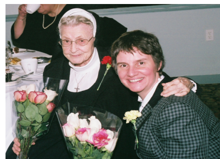
Oldest & Newest Nun's