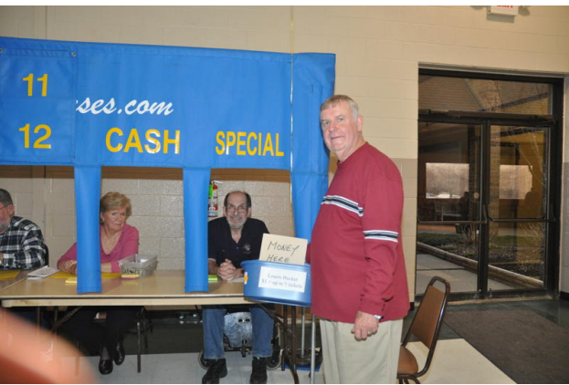
Brother Knight and wives selling tickets on the races.