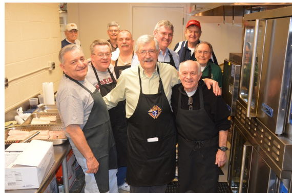
Some of the cooking crew at St. Clarence for the Lenten Fish Fry's