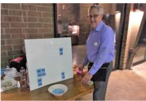
Knight at the Races