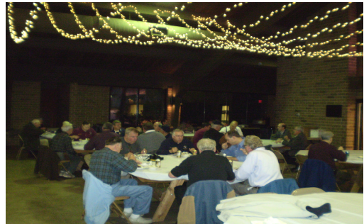
65 Knights enjoyed the steak dinner. Maybe next year more Knights will be able to join the steak roast.