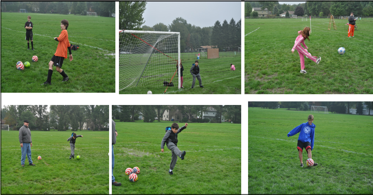
A few pictures from the Council/District Soccer Challenge.