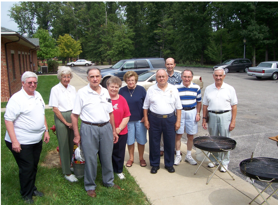
Knights at Parmadale Picnic