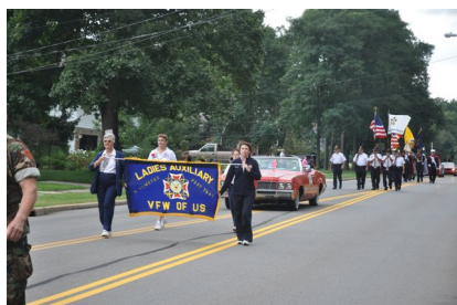
These pictures are of the Ladies Auxiliary and the Color Guard from the VFW post in North Olmsted