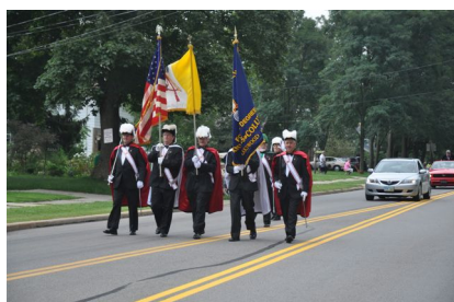
Top pictures left & right and below are the Fourth Degree Knight of Bishop O'Rielley Assembly. The Knight belong to North Olmsted Council 4731.