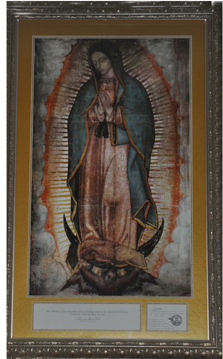
Icon of Our Lady of Guadalupe