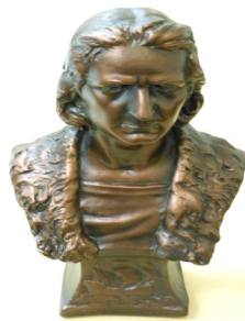
New Bust of Christopher Columbus for our meetings