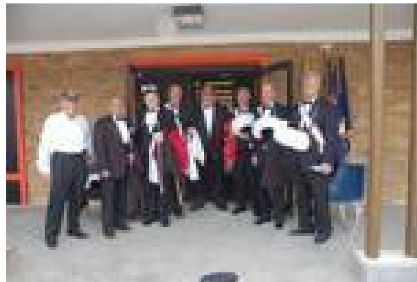
2008 North Olmsted Home Coming Parade With the Fourth Degree