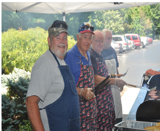
Knights Family Picnic