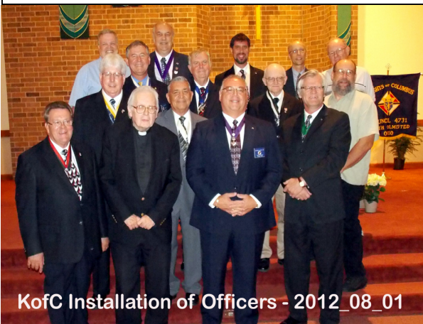
KofC Installation of Officers - 2012_08_01