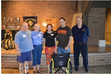
Wheelchairs donated by council 4731 to local Parish's