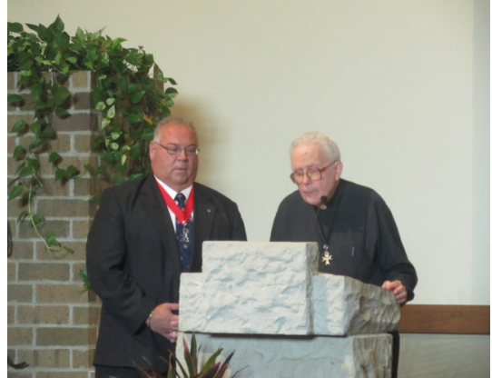
Council 4731 Officers Installation for the 2014—2015 year.