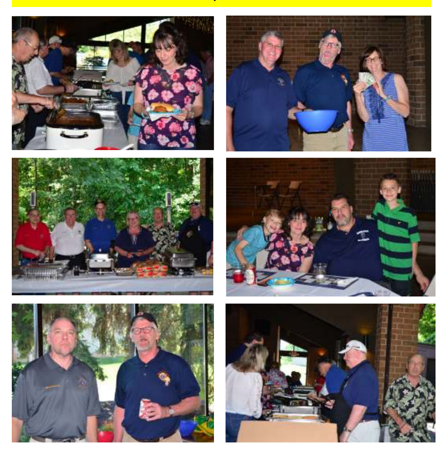
All had a great time.

Be sure to attend Next Year's Family Picnic.