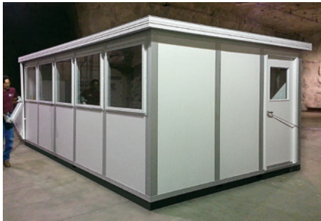
Oversized 12x20' exterior building shown. All Booths under 8x20' are shipped at standard rates.

InPlant's Booths, Guard Shacks, Control Rooms, Operator Cabs and Security Shelters are prefabricated in the factory, wired and shipped fully assembled. They are designed for easy shipping – all Booths under 8' by 20' ship at standard rates. Larger Booths require oversized shipping. The Booths are built on a welded steel channel base frame, which supports the structure, subfloor and vinyl tile flooring. Fork pockets are formed in the steel base for easy unloading and placement using a forklift.