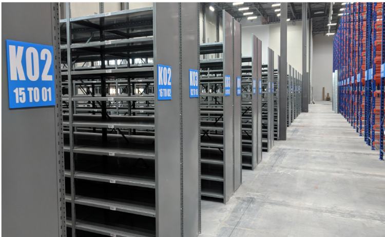
Interlok Shelving System application for a distribution centre for tools and hardware products

Multi-tier system using Interlok Shelving customized for an auto parts and accessories distribution centre