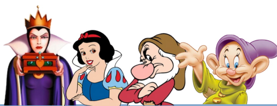
Storybook Dining Artist Point