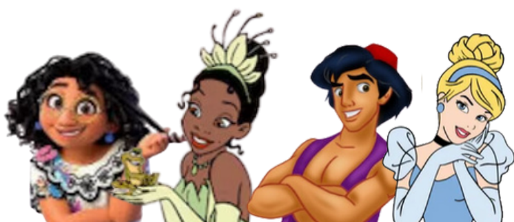
1900 Park Fare (Grand Floridian)