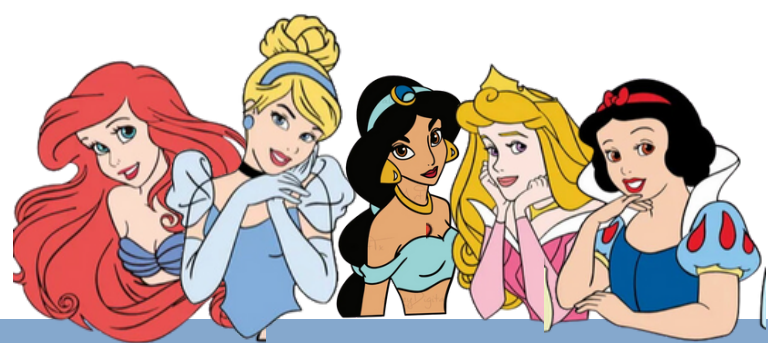
Cinderella's Royal Table (MK)