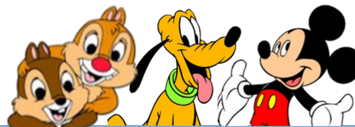
Garden Grill (EP)