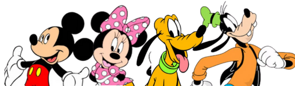
Hollywood & Vine (HS)