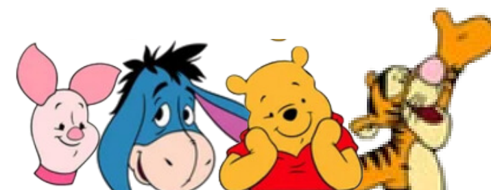
Crystal Palace (MK)