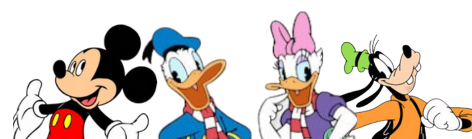
Tusker House (AK)