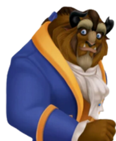
Be Our Guest (MK)