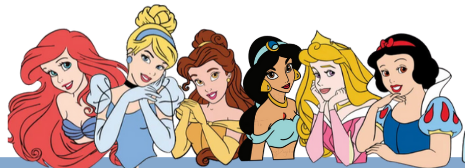
Akershaus Royal Banquet (EP)