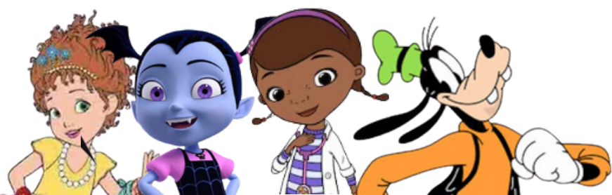
Hollywood & Vine (HS)