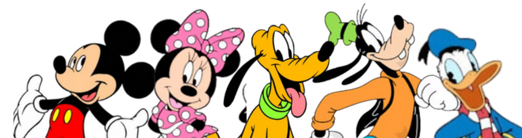
Chef Mickey's (Contemporary)