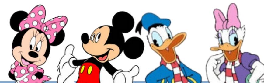
Toppolino Terrace (Riviera)