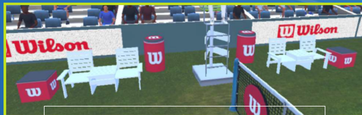
In App - Player Bench & Water Cooler