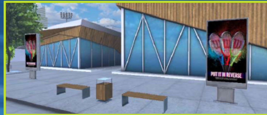
In App - Branding in lobby advertising walls