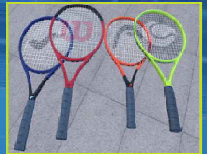
In App - Racket Branding