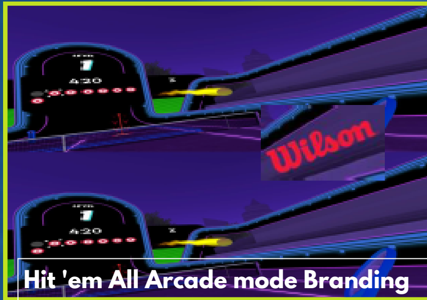
Hit 'em All Arcade mode Branding