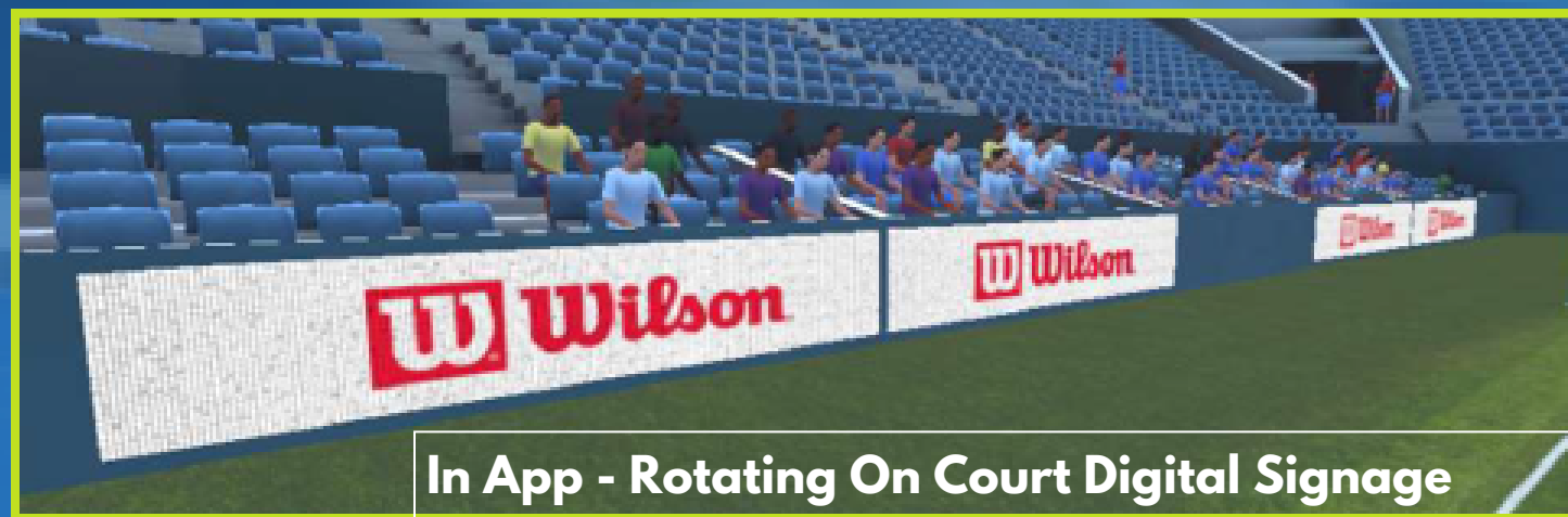
In App - Rotating On Court Digital Signage