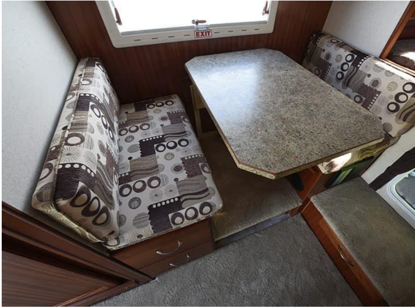
Above: This is a full-booth dinette in a 2018 Northern Lite 8-11 EX. This photo was taken at Truck Camper Warehouse a few days after the review unit was photographed.