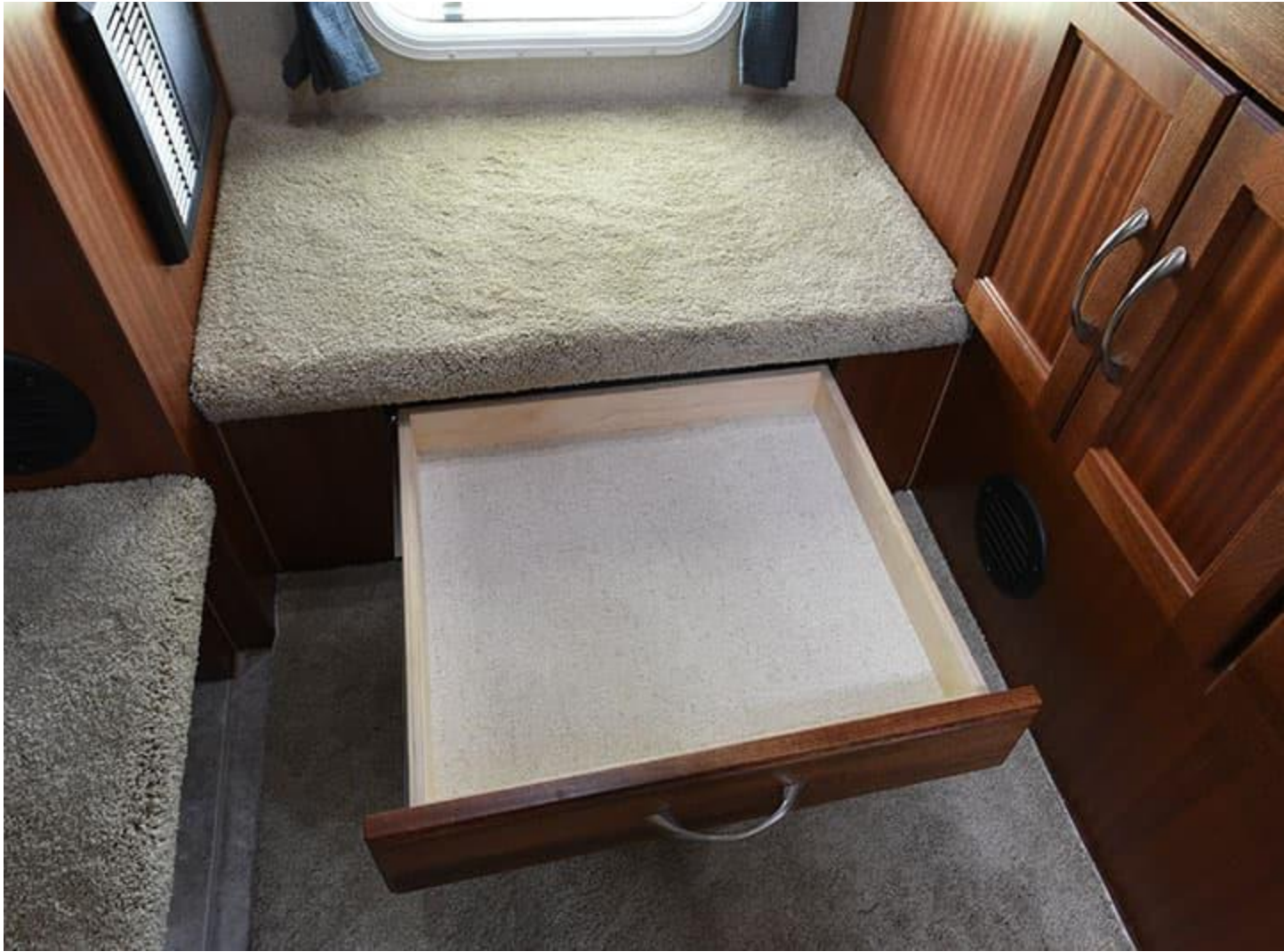
Under the step to the cabover is a wide, long, and shallow drawer.