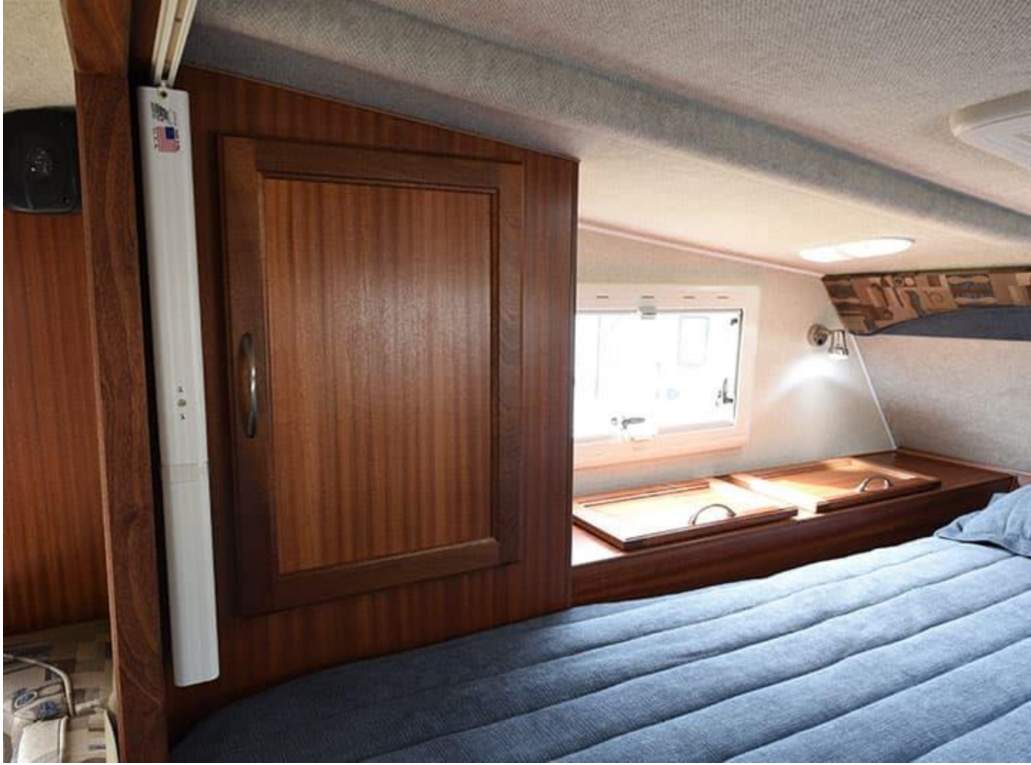
The driver's side the cabover features a deep hanging closet that extends below the mattress line, and two more hampers.