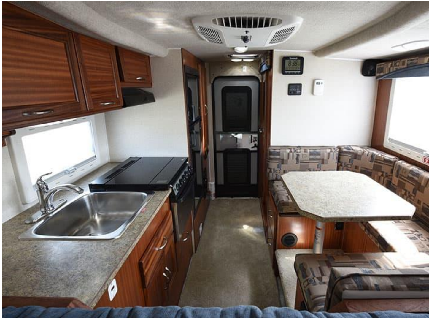
Above: Northern Lite 8-11 EX interior – front to back

The only available options are a 9200 BTU Coleman Mach 8 air conditioner, boat rack, camo graphics, Thetford cassette toilet, gas/electric hot water heater, dually brackets, microwave, U-shape dinette, and 7300 remote controlled Fantastic Fan. Most of the Special Editions on dealer lots will have the air conditioner, gas/electric hot water heater, and microwave. Needless to say, Northern Lite's Special Editions campers come brimming with luxury features.