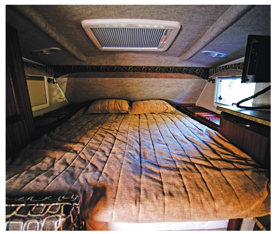
Above: Absolute comfort in the boudoir