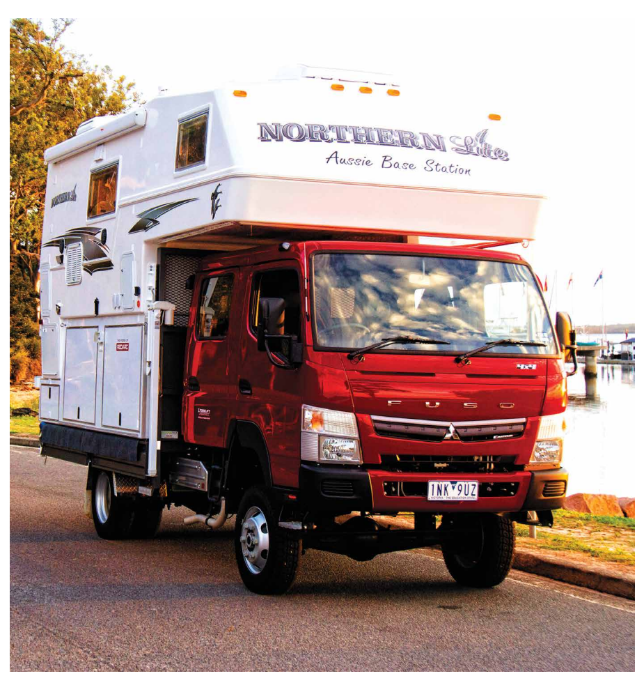
Above: The ABS shivering in despair as bitumen touches its tyres

While we were busy testing, a client visited the factory to oversee his order, and said he intended to use his ABS as a base of which to conduct his mobile business. As he plies the long, thousands of kilometres of western coast roads, the front annexe, he said, would be the perfect position for his mobile office.