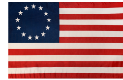
Betsy Ross Flag