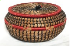
PAMUNKEY INDIAN CRAFTS