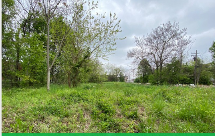
Current conditions of the site located between the 1100 block of E. North Ave & E 20th St. / 1900 block of Kennedy & Aisquith.