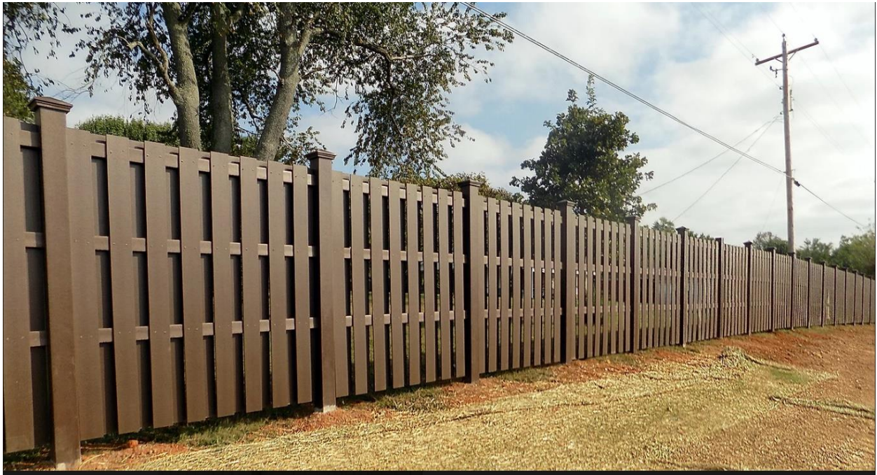
Shadow Box Vinyl