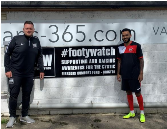
Footywatch Sponsors Reeko Best