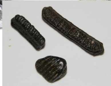
Ray mouth plate pieces