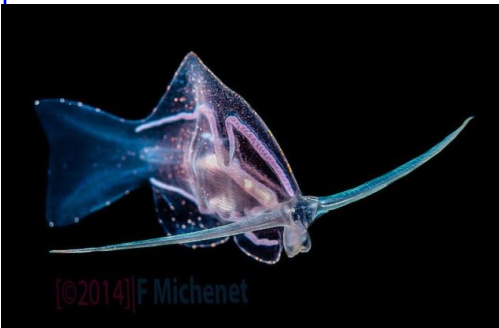
Meet Phylliroe, the swimming fish slug that can reach up to 5 cm in length.

Posted on November 18, 2015 by RR Helm in Deep Sea News