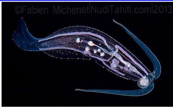
The white zigzag lines in Phylliroe 's otherwise clear body are digestive glands, helping it liquify jelly prey.

otherwise clear body. And when it's done digesting? Phylliroe defecates from an anus located in the middle of its right side. Because why not?