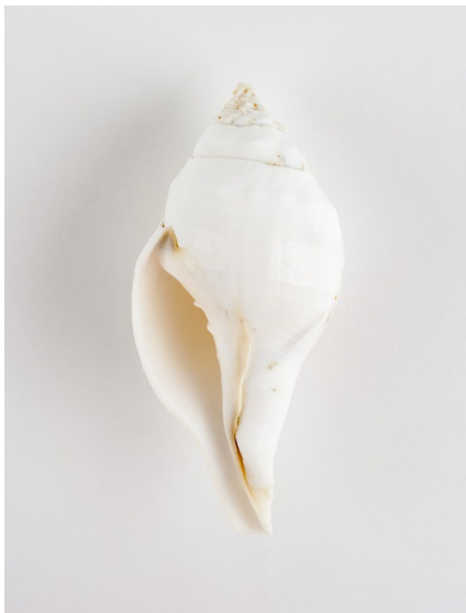
This rare specimen shows left-handed coiling of the Turbinella pyrum, or sacred chank.