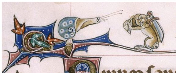
Knight v Snail VIII: Switcheroo! It's a Monkey This Time (from the Gorleston Psalter, England (Suffolk), 1310-1324, Add MS 49622 , f. 210v)

A very fun topic came up in the conch-L listserv over the summer, the topic of illustrations in early publications. Not just early, but truly medieval. Before books were widely printed they were hand-drawn and the text was hand-written. The artisans would embellish the already fancy text with loops, squiggles, and often artwork in the margins.