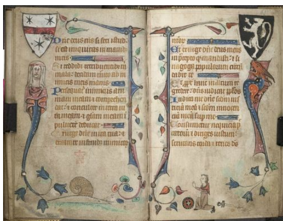
Knight v Snail VII: A Pretty Comprehensive Defeat (from a fragmentary Book of Hours, England (London), c. 1320-c. 1330, Harley MS 6563 , ff. 62v-63r)

A very fun topic came up in the conch-L listserv over the summer, the topic of illustrations in early publications. Not just early, but truly medieval. Before books were widely printed they were hand-drawn and the text was hand-written. The artisans would embellish the already fancy text with loops, squiggles, and often artwork in the margins.