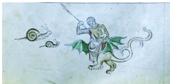
Knight v Snail IV: The Snails Attack (from the Queen Mary Psalter, England, 1310-1320, Royal MS 2 B VII , f. 148r)