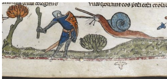
Knight v Snail IV: The Snails Attack (from the Queen Mary Psalter, England, 1310-1320, Royal MS 2 B VII , f. 148r)

Curiously, they often featured images of knights in armor engaged in combat with snails. Theories about the symbolism include snails as symbols of the resurrection, snails as symbols of outcasts (for treason, usury, and non-chivalrous behavior). The snail may be seen antagonizing the knight, and often the knight appears to be losing.