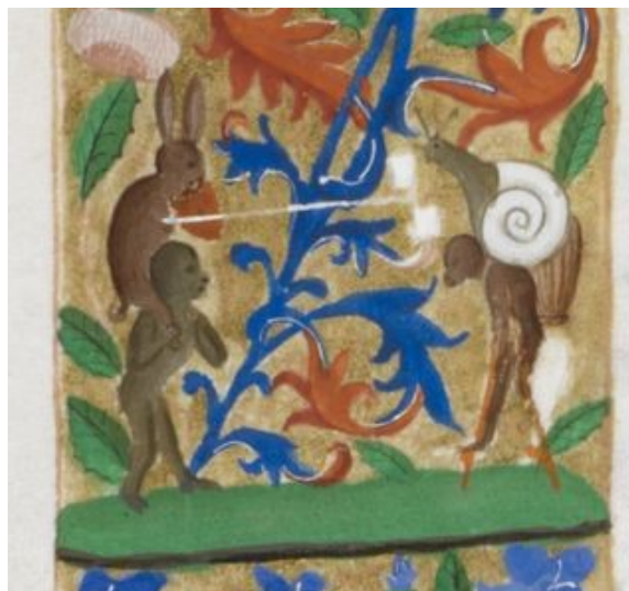
Knight v Snail IX: Just for Fun: A Rabbit, Monkeys, and a Snail Jousting (from the Harley Froissart, Netherlands (Bruges), c. 1470-1472, Harley MS 4379 , f. 23v)

To see the whole blog post by Ancient, Medieval, and Early Modern Manuscripts go to: https://blogs.bl.uk/digitisedmanuscripts/2013/09/knight-v-snail.html