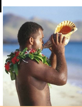
Show 'n Tell

April: Florida United Malacologists (FUM) Meeting July 7-12: COA Convention Corpus Christi, Texas