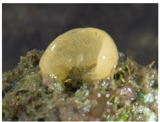
Mystery item about 25mm

The St. Petersburg Shell Club Presents their 74th Annual