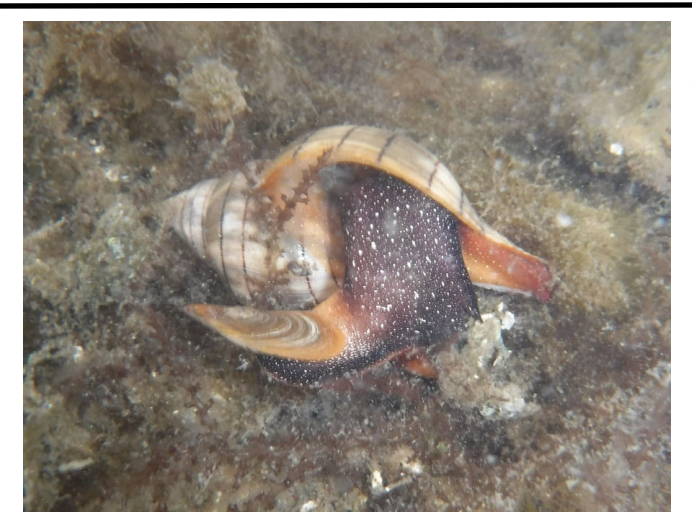
Cinctura hunteria (Perry, 1811)