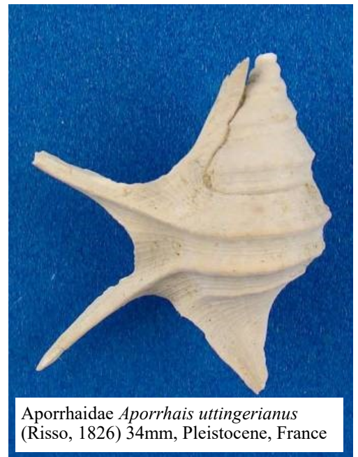
Aporrhaidae Aporrhais uttingerianus (Risso, 1826) 34mm, Pleistocene, France

Tides are for Mullet Key Channel (Skyway). Other specific locations may be up to 2 hours later or earlier. Listings from saltwatertides.com.