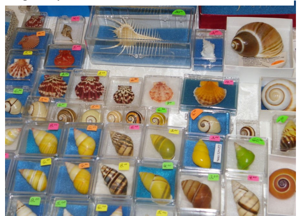
Shells for sale