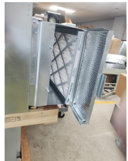
Inside look at the Filter Box Use with 1" or 4" Filters