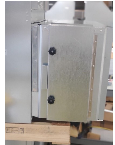
Filter Box attached to BPE-XE-MIR 1000 Adds 11" to the Base Module