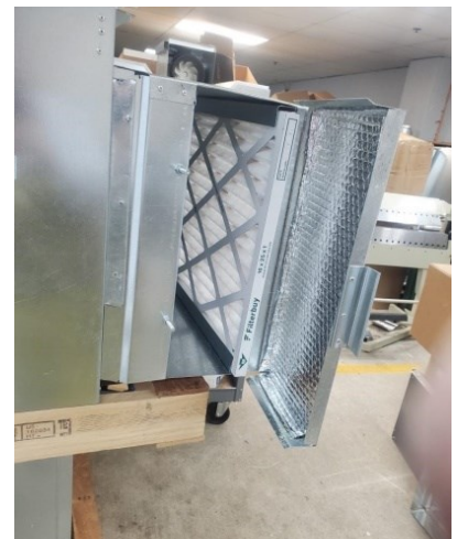
Inside look at the Filter Box Use with 1" or 4" Filters