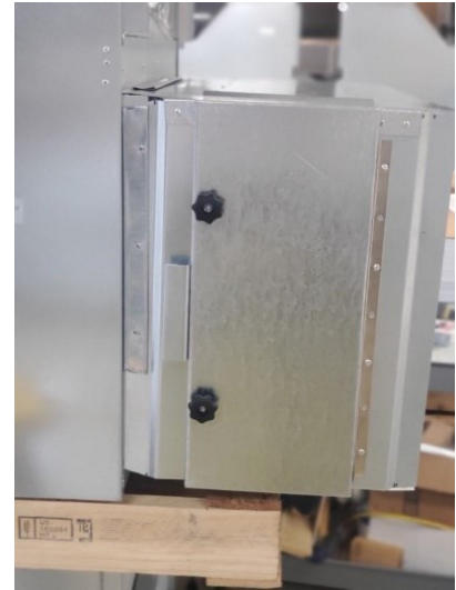
Filter Box attached to BPE-XE-MIR 2000 Adds 11" to the Base Module